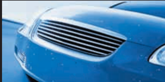
Typical damage on a leading edge painted surface without Scotchgard Paint Protection Film.