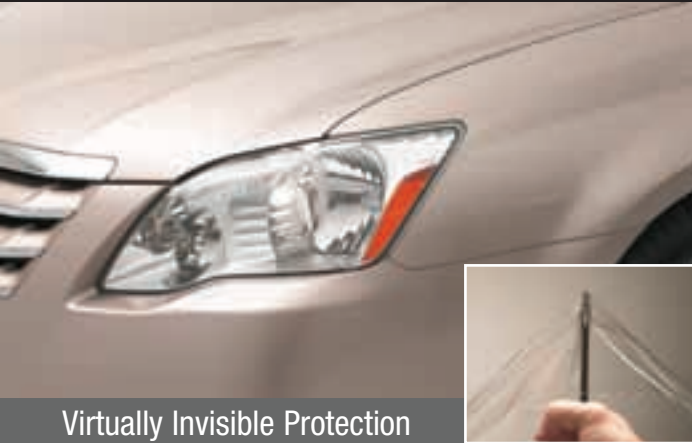
Virtually Invisible Protection

Scotchgard™ Paint Protection Film from 3M helps resist the stuff out there that harms vulnerable painted surfaces.