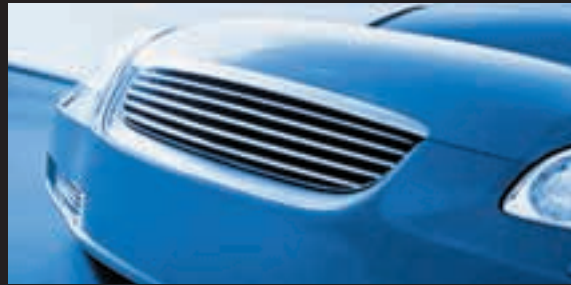
Same vehicle. Same leading surface. Notice the difference our tests confirm. Significantly reduces chips, dings and bug damage.

Additional information about Scotchgard™ Paint Protection Film is available from: